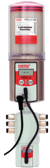
PRO C MP-6